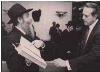
Senator Bob Dole